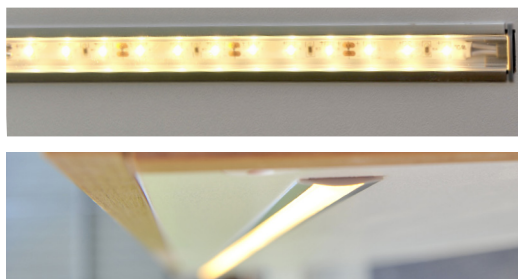
Images of Lighting Installed

NOTE: The lighting will be attached to the base panel of the mirrored cabinet or vanity. For the Brockton MC, Vera and Willow, the lighting will be attached to the base panel of the cabinet NOT attached to the base of the open shelf.