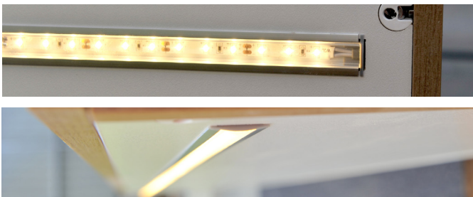
Images of Lighting Installed

NOTE: The lighting will be attached to the base panel of the mirrored cabinet or vanity. For the Vera and Willow, the lighting will be attached to the base panel of the cabinet NOT attached to the base of the open shelf.